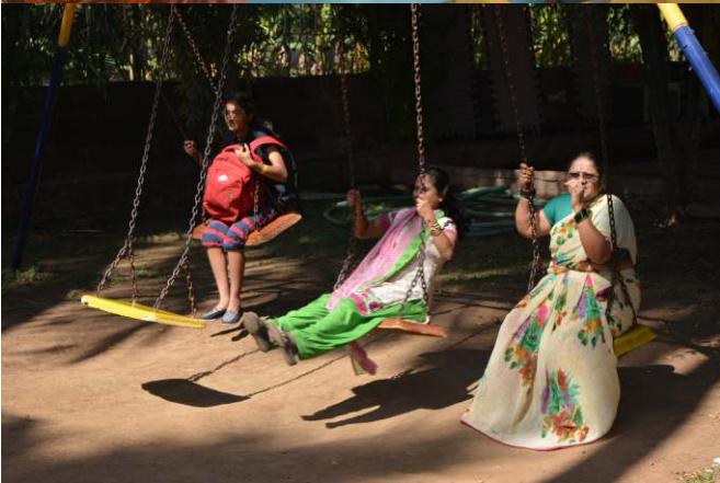
Annual Family Picnic at Arnala Beach Resort