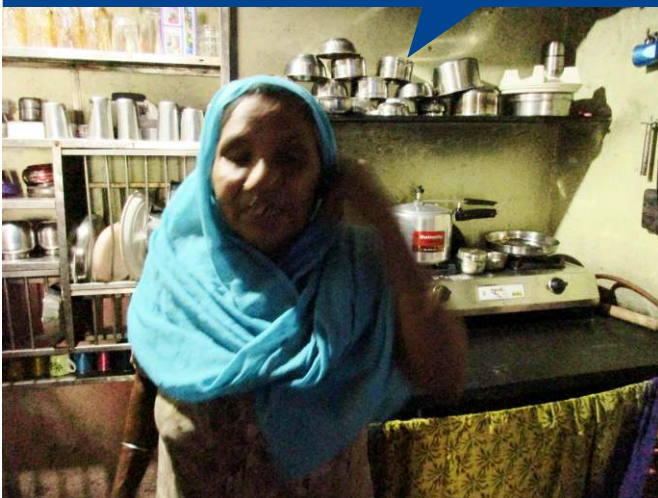
A beneficiary of House Repair fund

Under this scheme, BPA offers partial financial assistance to needy blind persons to acquire household articles such as Cots, Mattresses, Gas connections, Cupboards, Kitchen Racks, and Utensils etc. BPA also provides financial assistance to needy blind persons to meet unforeseen expenditure caused by fire, flood, building collapse, sudden death of earning member of the family. Total assistance of ₹59,322 was disbursed to 28 clients -16 female and 12 male clients.