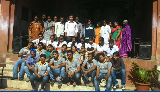
Health Camp at Vangani