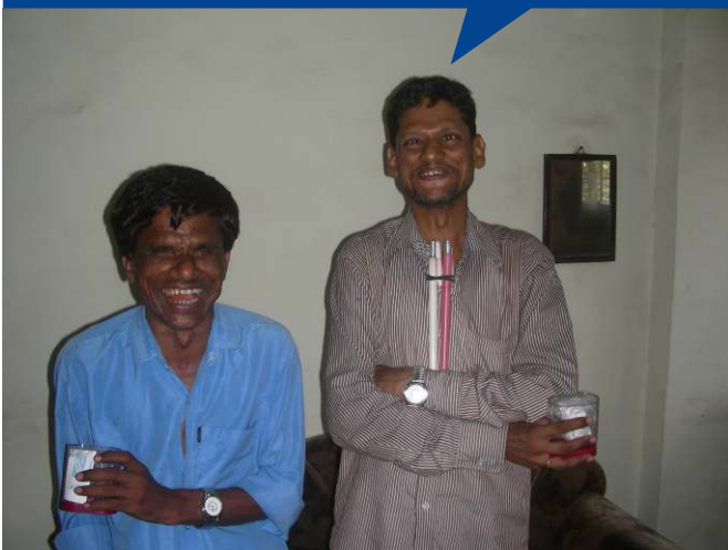
Distribution of Braille watches under Equipment Bank