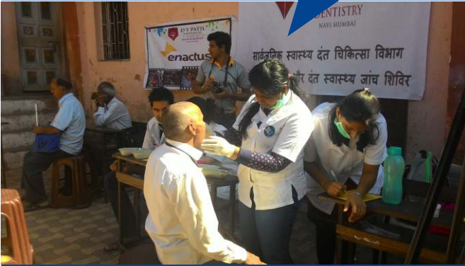
Health Camp at D. Y. Patil Medical College, Navi Mumbai