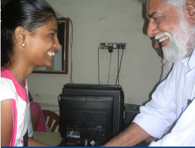
Scholarship for college going blind student