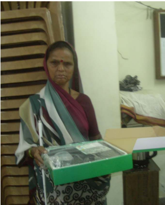
A lady receiving weighing scale for self employment

The response towards these camps boosted our confidence in organizing more such camps.